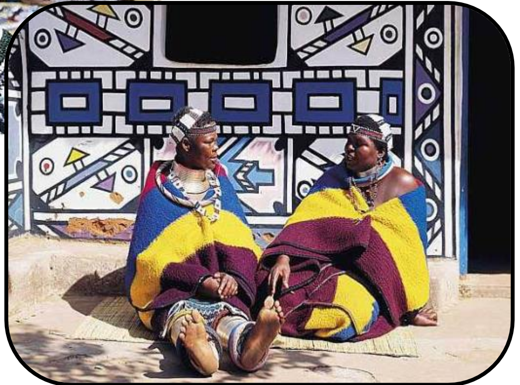
Woman with blankets